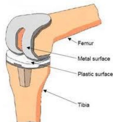
Figure 1 Typical knee replacement joint