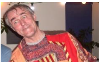
Honest Glani Hash Pundit

Biff – Evens - From the stables of Sir Glanville of Tavistock. This filly has seen a rapid improvement in form of over the past year, the training methods used in these stables could be questioned, all dope tests have proved negative? The bookies have seen some large bets placed, a lot of recent interest.