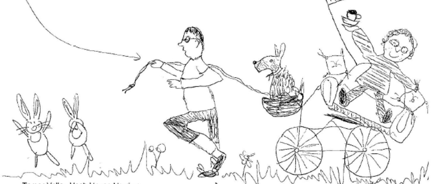
Tamar Valley Hash House Harriers